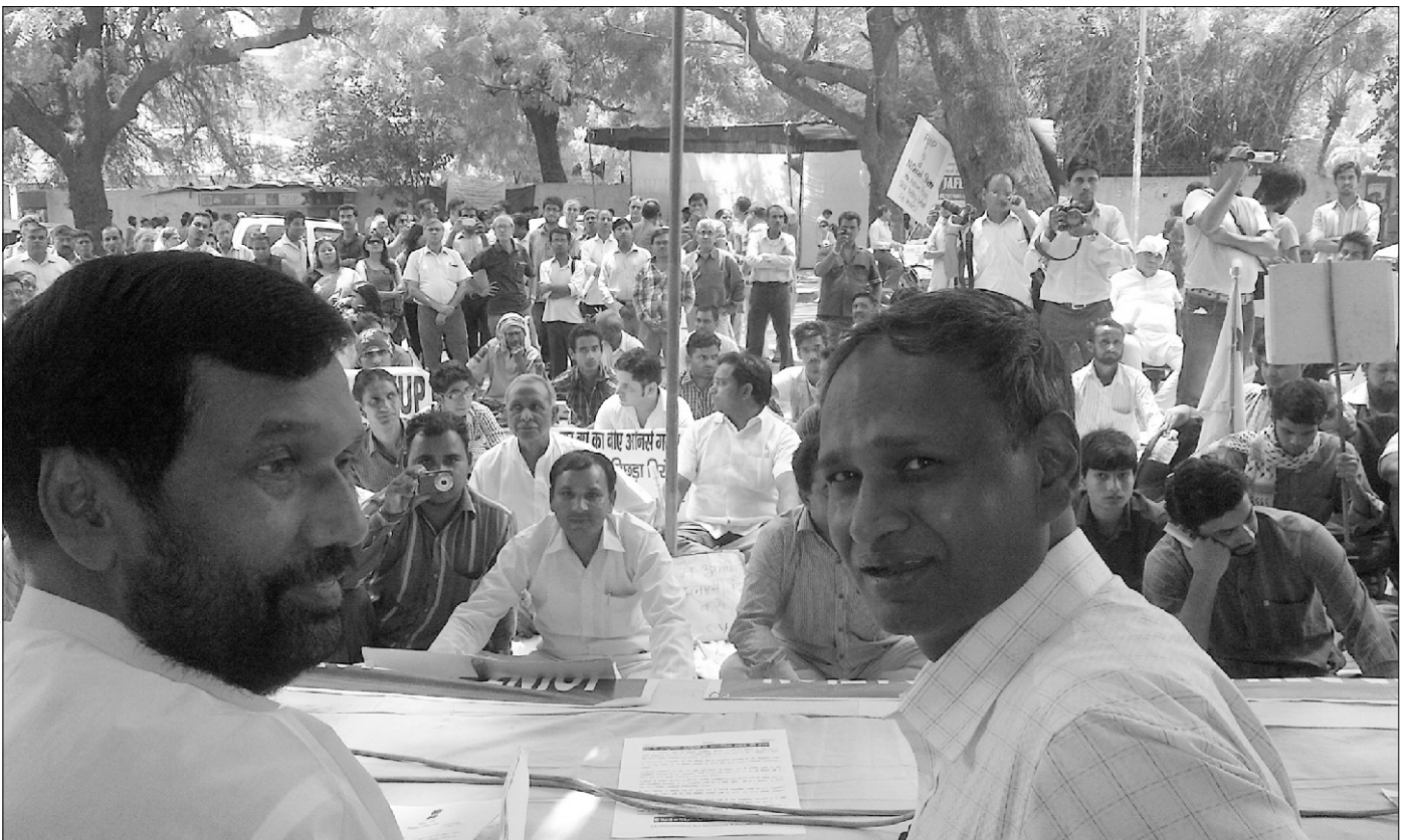
Ram Vilas Paswan and Dr. Udit Raj at the dais on the occasion of demonstration against FYUP at Jantar-Mantar

No longer it is now confined to Delhi University rather the civil society is taking lead and has vowed to fight till FYUP is not scrapped. FYUP violates the national education policy of 1986 adopted by Parliament and