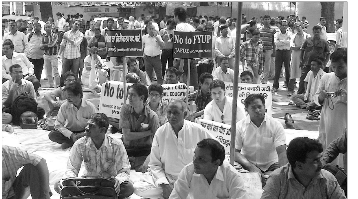
एफवाययूपी के खिलाफ धरना-प्रदर्शन के दौरान जंतर-मंतर, नई दिल्ली पर मौजूद अपार भीड़ का एक दृश्य।

दिल्ली विश्वविद्यालय में कैसे प्रवेश पा सकेंगे? एफवाययूपी की पठन-सामग्री दूसरों से कैसे मेल खाएगी, दो तरह के बीए करने वाले छात्रों को रोजगार लेने में कैसे नहीं असुविधा होगी? ग्रामीण, गरीब, दलित एवं पिछड़ी पृष्ठभूमि के छात्र को गणित, अंग्रेजी और विज्ञान पढ़ने के लिए मजबूर किया जाएगा। इस पाठ्यक्रम से तीन तरह की डिग्री मिलेंगी- दो वर्ष पर डिप्लोमा, तीन वर्ष पर बैचलर और चार वर्ष पूरा करने पर ऑनर्स जिससे छात्रों में हीन भावना पैदा होगी व शिक्षा जगत में असमानता बढ़ेगी। यह भूलना नहीं चाहिए कि दिल्ली विश्वविद्यालय अन्य 700 विश्वविद्यालयों के ही समान है न कि यह अनोखा है जैसा इस समय दिखाने की कोशिश की जा रही है।